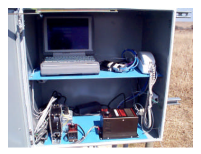
Fig. 2. Typical ARM SGP extended facility enclosure installation.

OU and ARM have been testing a laptop-based Linux system at the Pawhuska EF since March 2000. The data communications equipment and instrumentation at the EF are supported by AC power line regulation, surge suppression, and a UPS. The Linux laptop and associated data modem are installed in a non-insulated, white-painted steel, NEMA 4, sealed electrical enclosure attached to posts on a concrete pad, with the largest surfaces facing the south and north. An internal circulation fan runs continuously to aid the dissipation of heat from the enclosure. A thermostatically controlled, 100 watt heater maintains the internal temperature to greater than 5° C in the winter. Figure 2 illustrates a typical EF enclosure installation.