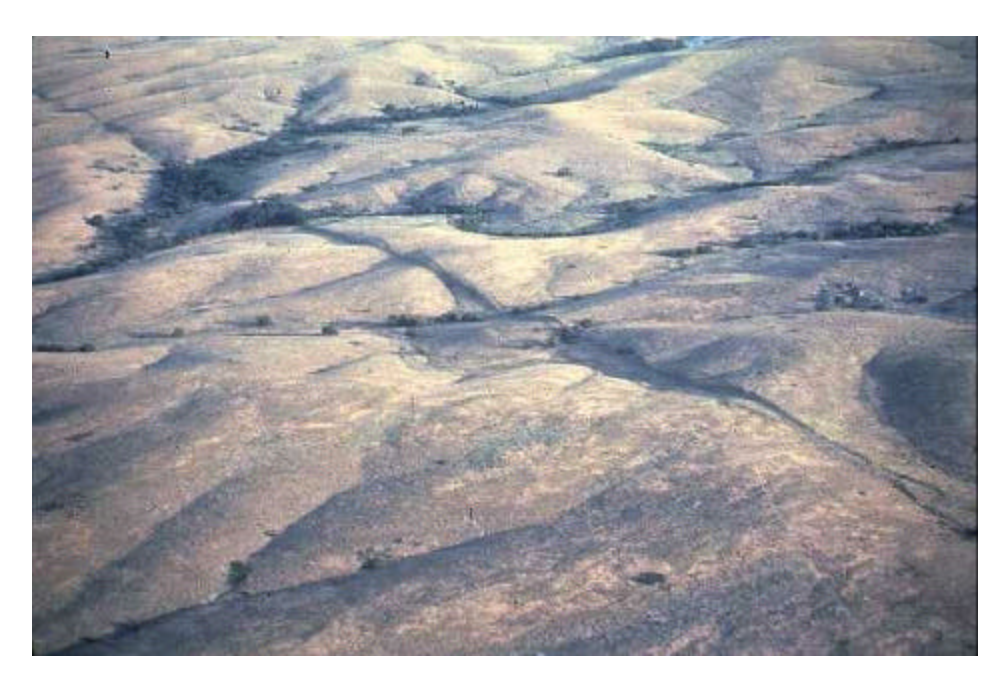
Fig. 4. The Meers Scarp in southwestern Oklahoma. It is the only visible fault scarp east of the Rocky Mountains. The scarp can be seen in this low-sun-angle air photo running from the upper left corner of the image to the lower right corner. In some places the scarp exhibits several meters of vertical offset.