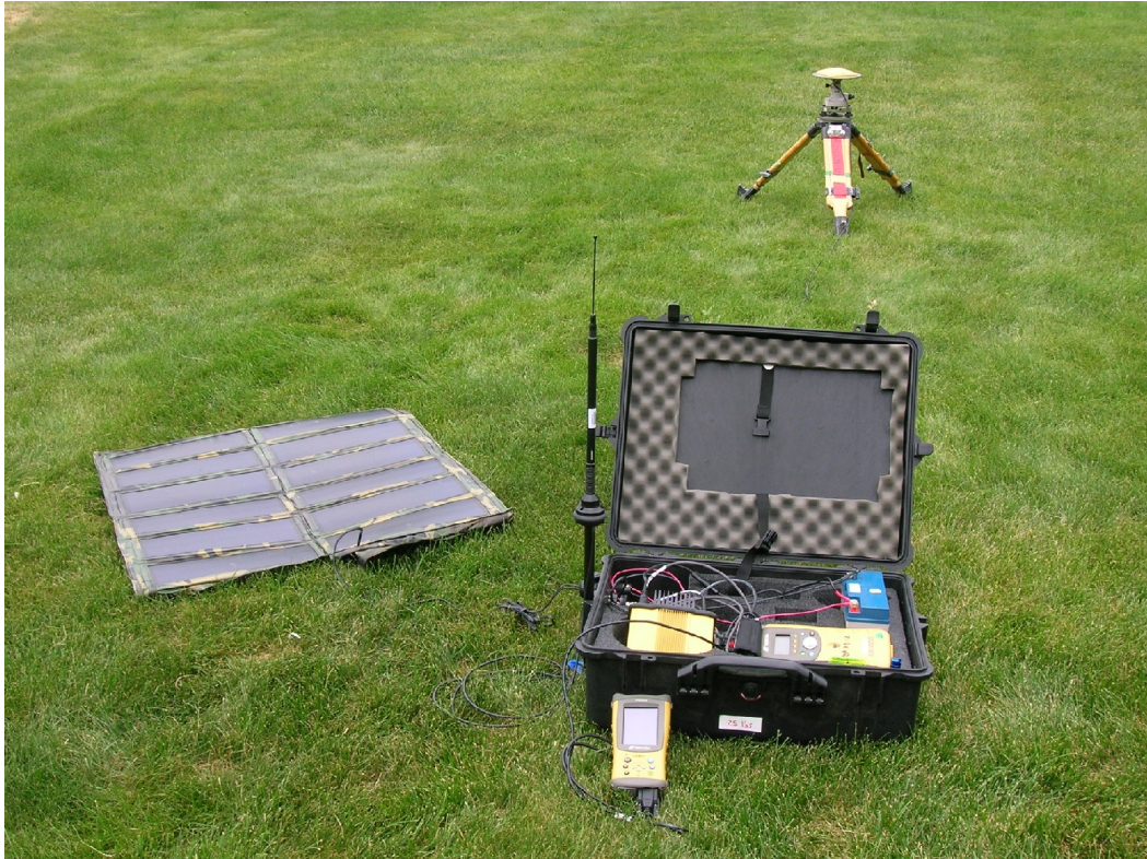
Battery and solar-powered RTK base station with Topcon GB-1000 Receiver, PG-A1 GPS Antenna, and FC-100 Data Controller. Radio antenna (left of case) has not yet been mounted.