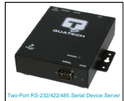
Two-Port RS-232/422/485 Serial Device Server

A Serial Device Server (SDS) is a computer in a very robust and compact package (approximately the size of a deck of playing cards) that contains a built-in operating system and TCP/IP stack. State-of-the-art SDS models also contain a built-in Web server that allows configuration and monitoring through a client PC's Web browser.